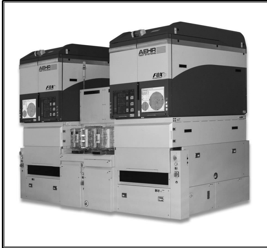
Aehr Test Systems FOX-1P Full-Wafer Test System