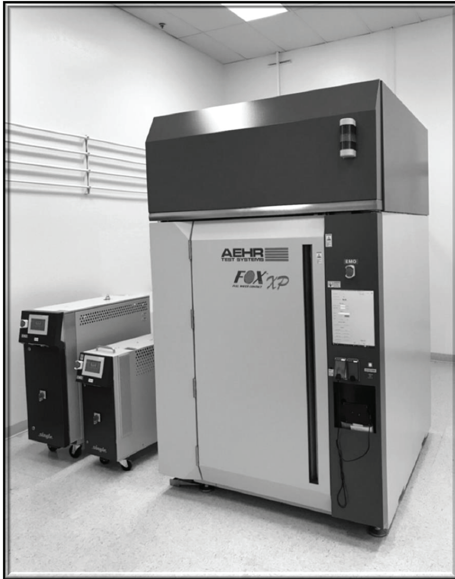
Aehr Test Systems FOX-XP Multi-Wafer Test & Burn-in System